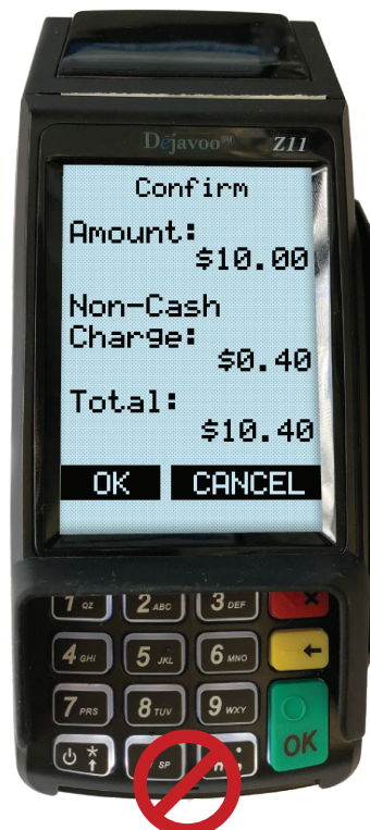
Non Compliant Terminal