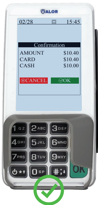
Compliant PIN Pad